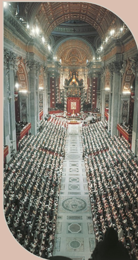
Italy 20th century. Photograph. Britannica ImageQuest, Encyclopædia Britannica, 25 May 2016. quest.eb.com/images/126_479644 . Accessed 18 Jul 2023.